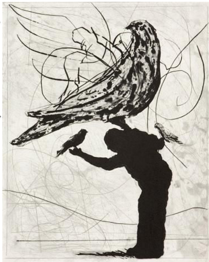
ABOVE TOP Edward Lear, Fish on stilts 1845 BOTTOM Edward Lear Dong with a luminous nose 1845 RIGHT William Kentridge Magic Flute, Man+Bird, 2005