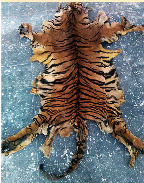
3yr old tiger skin, seized from Maharashtra, image The Hindu 12/21/14