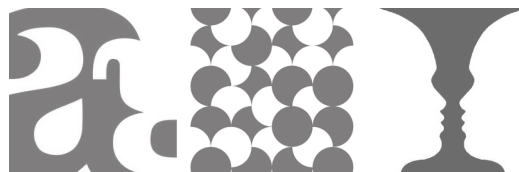
examples of three figure ground drawings

2. Make a measured survey drawing of the skin you have cut from your mold. You might need to make further cuts to flatten the skin. Record this shape as accurately as you can. Then make a figure ground drawing which should be scaled (up or down) to almost fill an 18x24 sheet. The figure shape should then be cut from black paper and laid on the line drawing on 18x24 sheet.