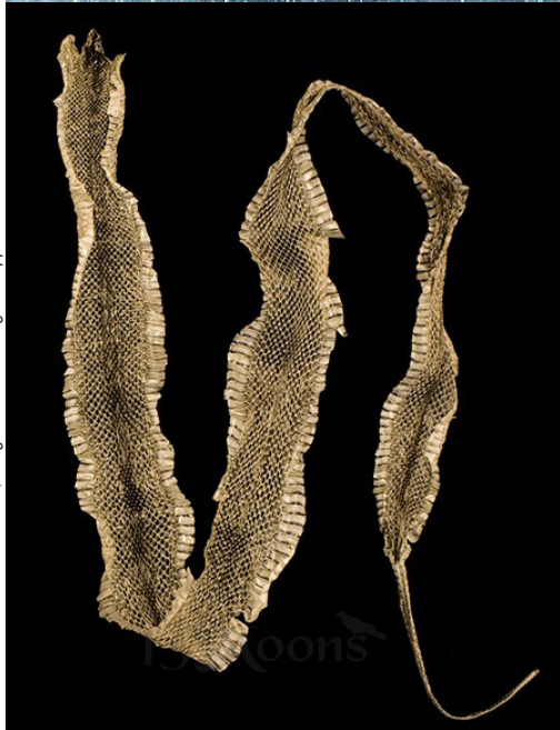
small shed snake skin, image 13 moons medical supplies.